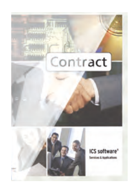
Matt finish at the front and clear