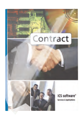
Clear finish at the front and matt finish at the back